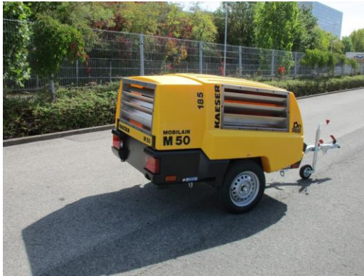
Caption: Prototype of the diesel powered Kaeser M 50 including aquaculture modifications

Approved for publication, copy acknowledgement appreciated