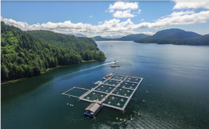
Caption: A Sea Pen Aeration system in full operation at a salmon farm site. Note: Four plumes of aeration inside each pen. [Source: Pentair Aquatic Eco-Systems]

Kaeser photo(s) – free for publication, credits appreciated.