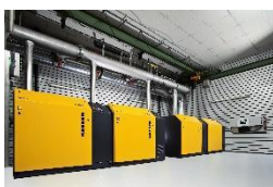
Caption: Modern rotary screw blowers can be arranged side-by-side