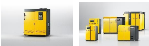
Caption: Turbo blower versus rotary screw blowers.