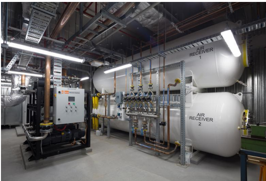
Caption: The compressed air treatment package includes Kaeser filters - the key component to produce compressed air to all purity classes as per ISO 8573-1.