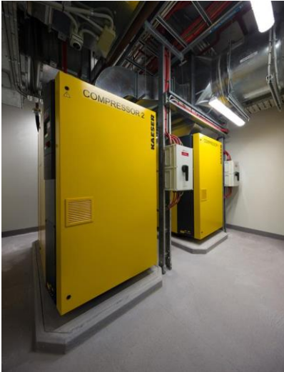
Caption: The Kaeser compressed air system at The Royal Hobart Hospital