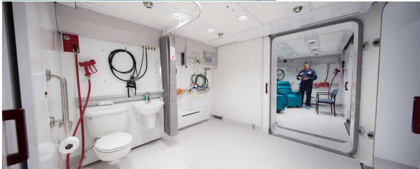
Caption: High quality, dry and clean compressed air is essential for a medical hyperbaric chamber to operate. Pictured here the new state-of-the-art hyperbaric chamber at The Royal Hobart Hospital.