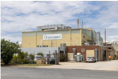
Caption: Geofabrics Australasia is Australia's largest manufacturer and supplier of a range of highly engineered geosynthetics for the building and infrastructure sector. Pictured here the Albury manufacturing plant.