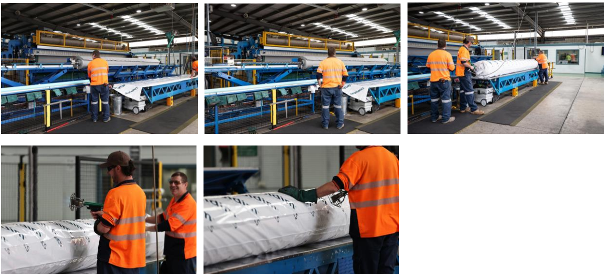
Caption: Compressed air is an essential utility required to operate many functions at Geofabrics - pictured here the end of line machinery and packaging of the final products