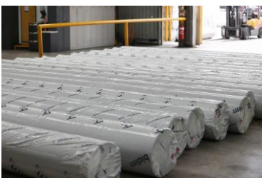
Caption: Geofabrics' products are a key component in building Australia's critical infrastructure. Pictured here, some end product wrapped and ready to be despatched.