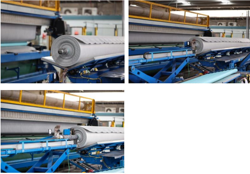
Caption: Compressed air is an essential utility required to operate many functions at Geofabrics - pictured here some end of production line machinery