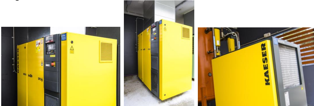
Caption for above selection of photos: The Kaeser ASD 60 SFC rotary screw compressor with Sigma Frequency Control complete with an air treatment package at Master Benchtops.