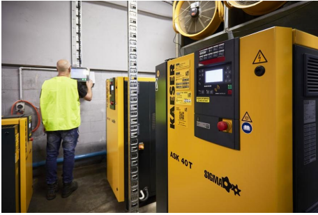
Caption: To ensure complete control and transparency, a Sigma Air Manager 4.0 (SAM 4.0) was installed.