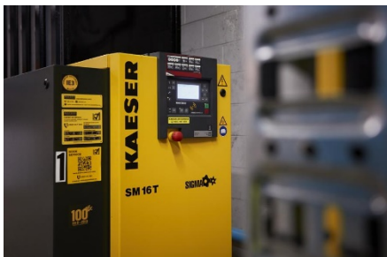
Caption: The Kaeser SM 16 T provides the required compressed air when demand is low.