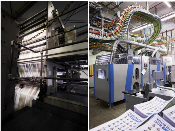
Caption: Compressed air is an essential utility used to power around 80 percent of all the machinery onsite. This includes the very large multi story print press that produces the majority of newspapers published by Stuff.