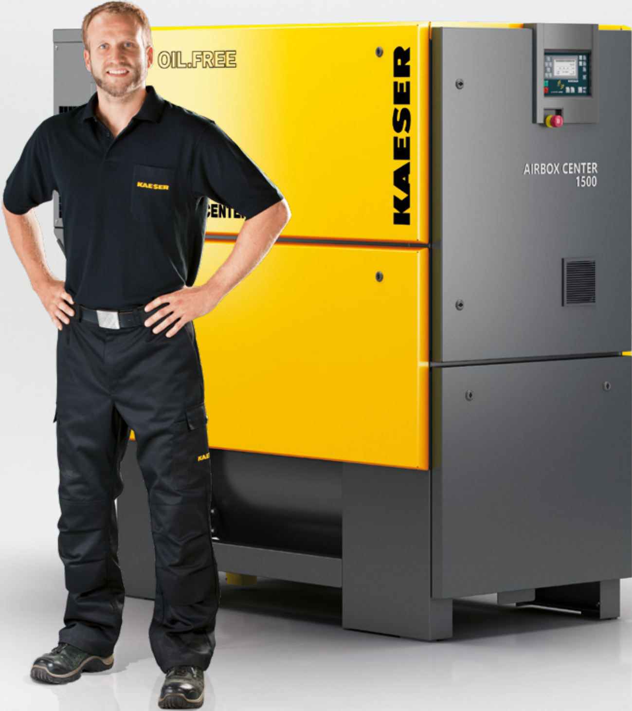
Image: AIRBOX CENTER 1500