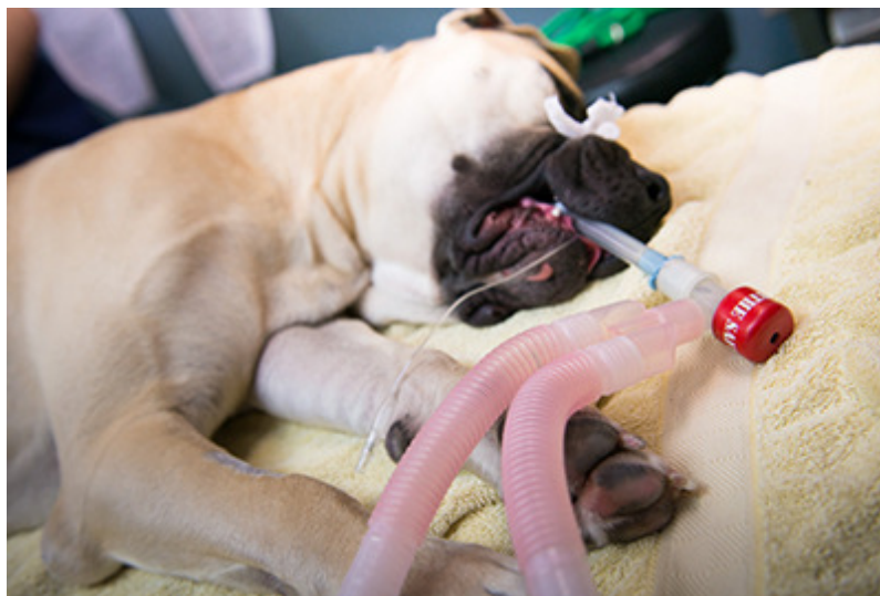
Caption: The RSPCA Victoria's veterinary clinic in Burwood East utilising the oxygen supply plant system to provide oxygen to Alfie in surgery.