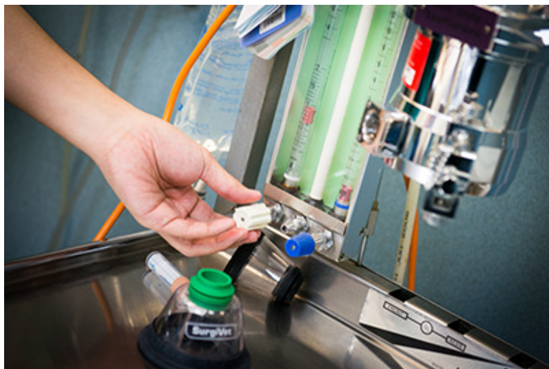
Caption: The oxygen supply plant allows the RSPCA Victoria's veterinary clinic in Burwood East to make its own oxygen as and when required.