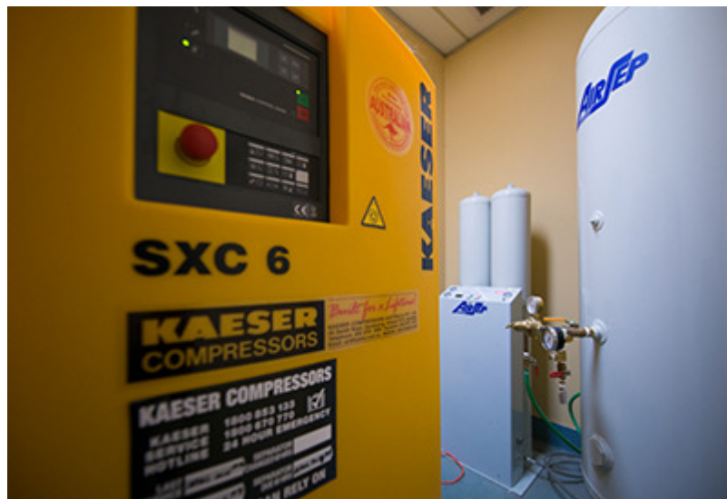
Caption: Compactly installed, the oxygen supply plant at the RSPCA Victoria's veterinary clinic in Burwood East, generates oxygen which is then available via a piping system into all of the surgery rooms.

Images: (contact the press office for high res copies of the following images)