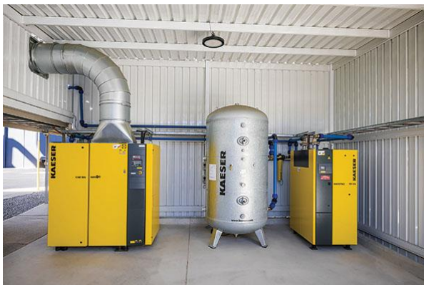
023_Image 2_compressed air at Hume Doors.jpg

Caption: The complete new Kaeser compressed air station at Hume Doors including the CSD 125 rotary screw compressor.