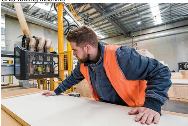
023_Image 3_CNC routing machine at Hume Doors.jpg