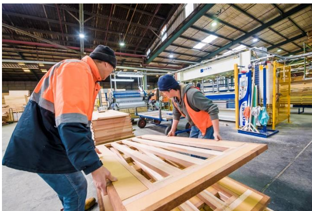
023_Image 7_production process at Hume Doors.jpg