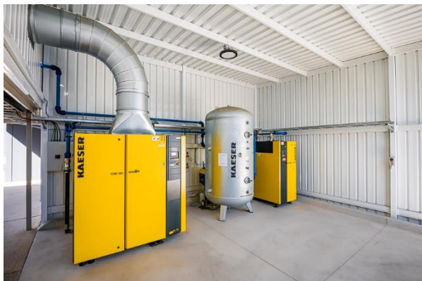
023_Image 1_compressed air at Hume Doors.jpg