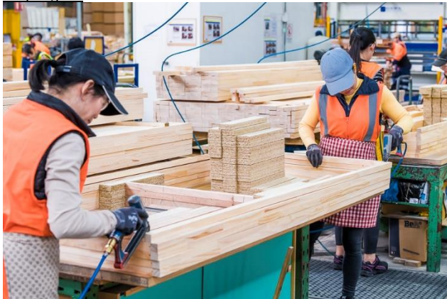
023_Image 5_staple guns being used at Hume Doors.jpg