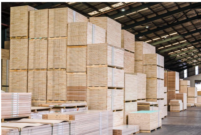
023_Image 12_finished doors at Hume Doors.jpg

Caption: The finished products! Hume provides innovation in doorway technology and manufactures an extensive range of products - over 2,000 to be exact.