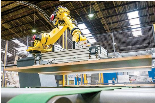
023_Image 8_axis robot lifting and moving the finished doors at Hume Doors.jpg