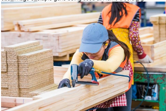
023_Image 6_staple gun being used at Hume Doors.jpg