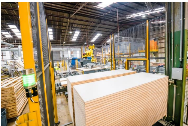
023_Image 9_axis robot stacking finished doors at Hume Doors ready for despatch.jpg

Caption: Compressed air powers a number of axis robots that vacuum grip the doors, taking them through the final stages of the production process before they are stacked ready for despatch.