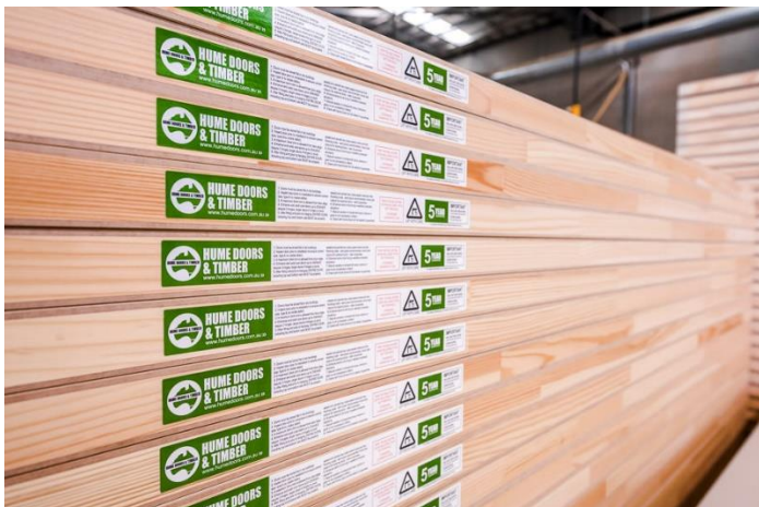
023_Image 11_finished doors at Hume Doors.jpg