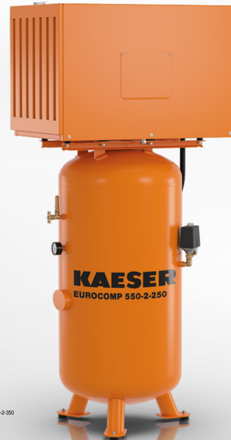
Image: EPC 550-2-350

High-quality components for a long service life