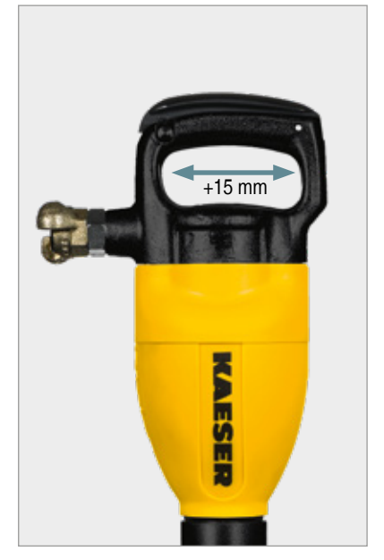
Wider grip aperture