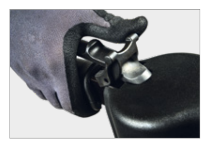
Ergonomic trigger lock