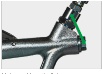
Male stud handle fitting