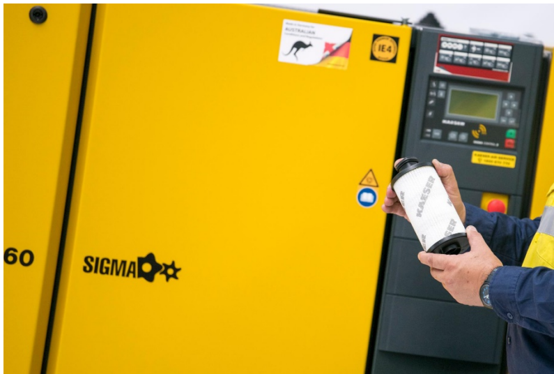
Caption: Only genuine Kaeser spare parts and consumables have been rigorously tested by Kaeser with the compressed air equipment.