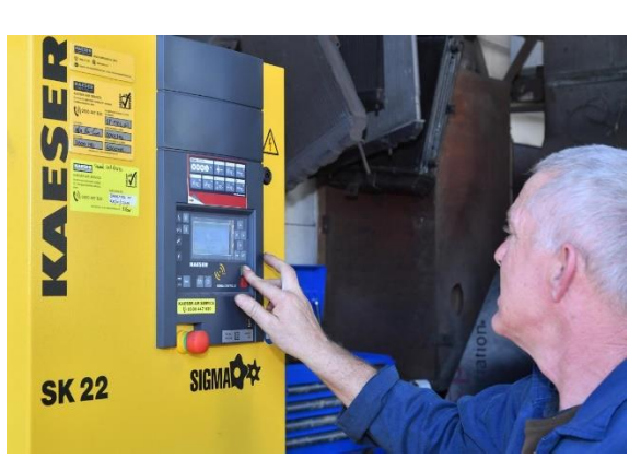
Caption: Kaeser recommended and subsequently installed an Aircenter SK 22 to replace the ageing compressor at Trevor French Radiators.