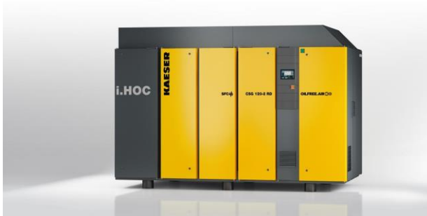
Caption: A Kaeser dry-running rotary screw compressor featuring the patented i.HOC rotating dryer.