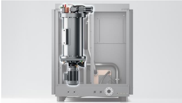
Caption: The i.HOC dryer is integrated into Kaeser's dry-running rotary screw compressor.