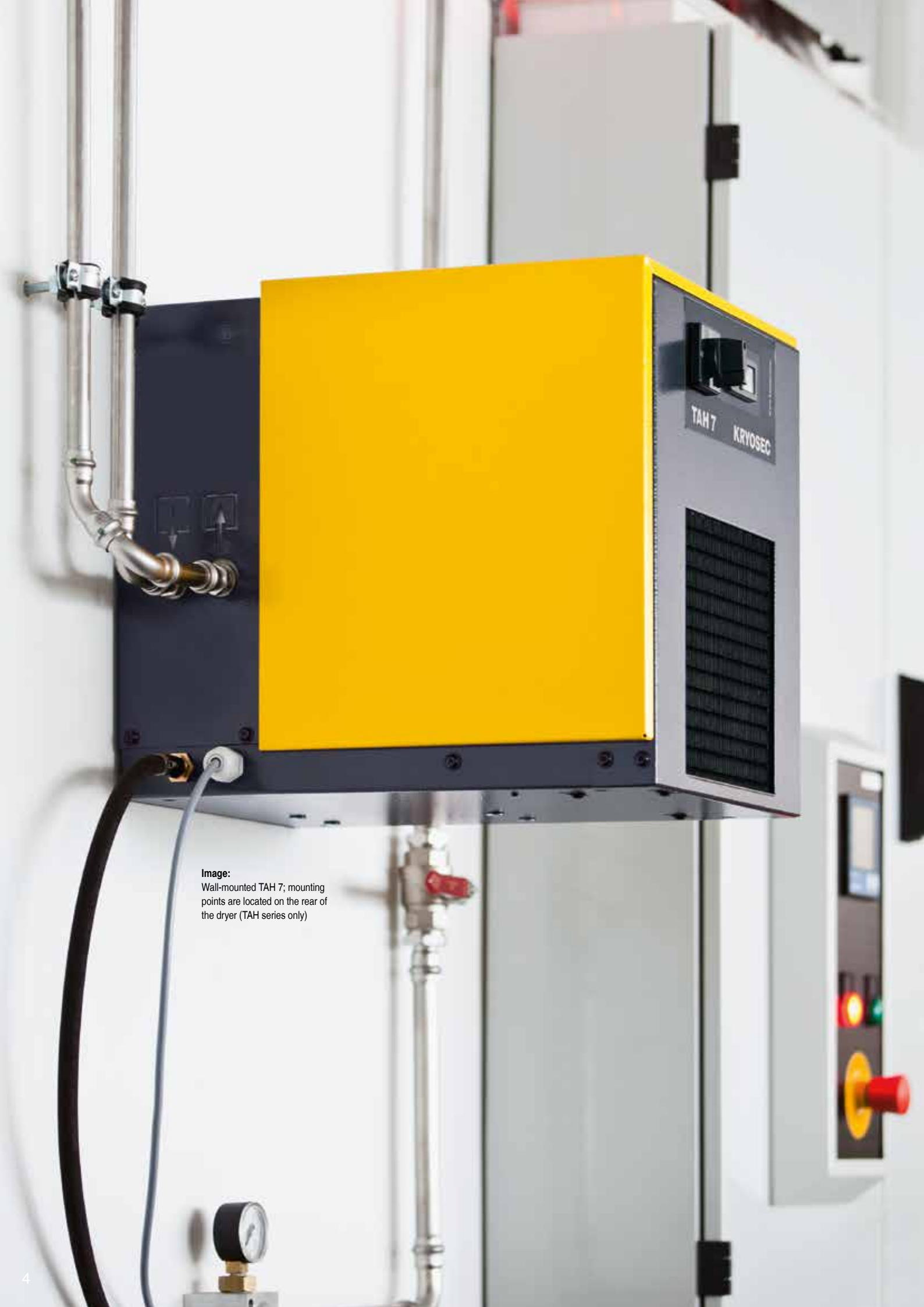
Image: Wall-mounted TAH 7; mounting points are located on the rear of the dryer (TAH series only)