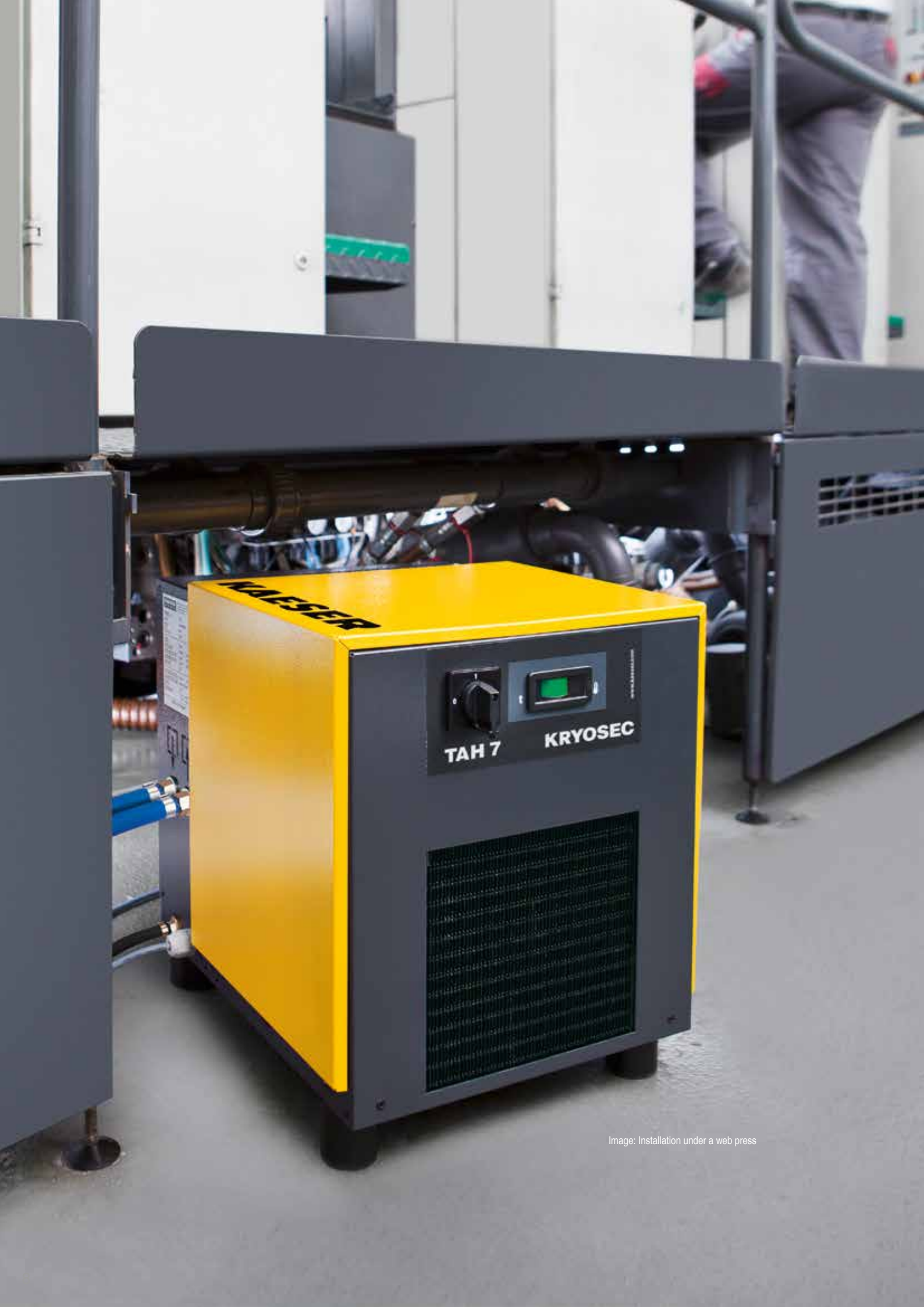
Image: Installation under a web press