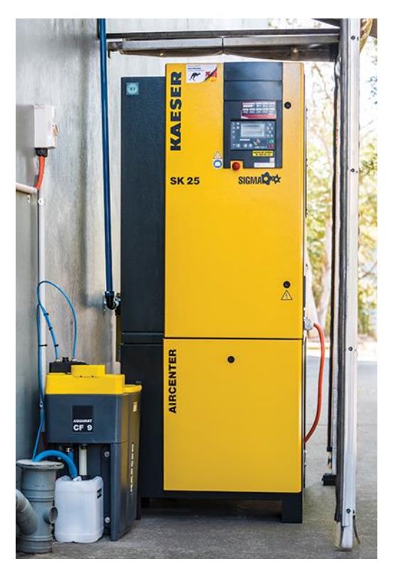
Caption: Bright chose to replace an ageing compressor with a new Kaeser Aircenter 25