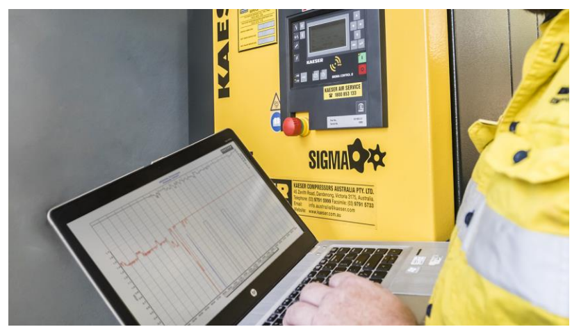
Caption: Kaeser was invited to perform a complete Air Demand Analysis (ADA) on the existing compressed air system